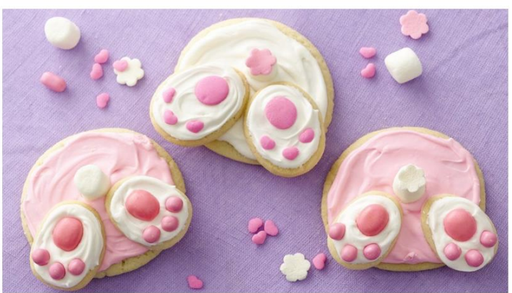
How insanely adorable are these Bunny Butt Cookies from Pillsbury?! Make your own cookies (we've a recipe here) or use shop-bought cookie dough.

https://www.mykidstime.com/food-and-recipes/10-cute-easy-easter-cookies-kids-love/